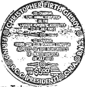
Symposium Token (antiqued silver-finish)

Coin Week North America pin-backed badges.